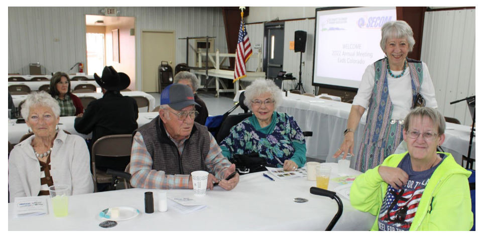
SECPA's annual meeting in Eads brings together members from the service territory to hear about the current status of the cooperative, share a meal and win prizes.