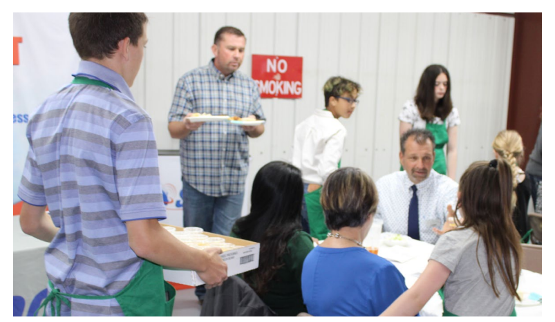
The Prairie Queen 4-H Council serves the meal at the annual meeting.