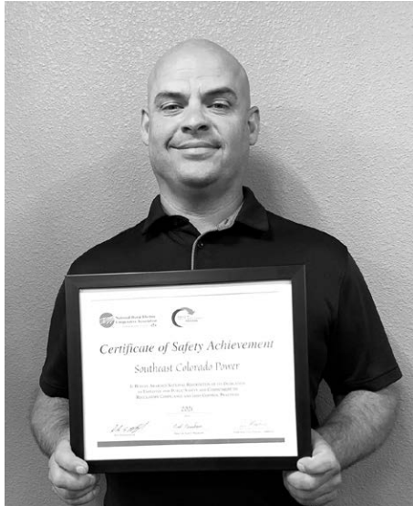
▲ The Rural Electric Safety Achievement Program recently awarded SECPA national recognition for its dedication to employee and public safety and commitment to regulatory compliance and loss control practices by the National Rural Electric Cooperative Association.